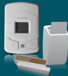
VTST Wireless WiSPER Thermostat + IKCS Hotel Keycard Switch + EDWS Outside Door/Window Sensor