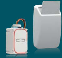
EHSM HVAC Setback Module + IKCS Hotel Keycard Switch

Sample Wireless Kits (go on-line for more configurations)