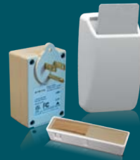
IPAC Plug-in AC Module + IKCS Hotel Keycard Switch + IRTS Remote Temperature Sensor