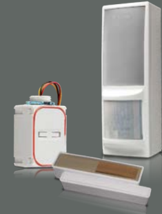
EHSM HVAC Setback Module + EDWS Entry Door Sensor + EOSW Motion Occupancy Sensor

Sample Wireless Kits (go on-line for more configurations)