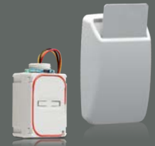
IPAC Plug-in AC Module + IKCS Hotel Keycard Switch