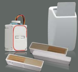
IPAC Plug-in AC Module + IKCS Hotel Keycard Switch + EDWS Outside Door/Window Sensor + IRTS Remote Temperature Sensor